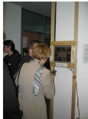
Figure 1. InfoLab visitor interacting with the Hermes Photo Display (March 2006).

A brief user trial was carried out in March 2006 (see Figure 1 below) in which the system was used in an unprescribed fashion by a small number of visitors to the Computing Department. As you might expect, users spent some time matching up the grid pattern shown on their mobile phone with the grid pattern shown on the display, but users were able to complete selection and downloading tasks.