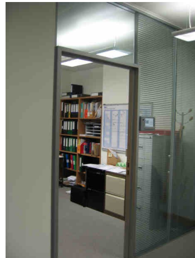
Figure 4. The Hermes II Office Door Display (taken March 2007).

The Hermes system was dismantled in July 2004 and working prototypes of a new version of Hermes (Hermes 2) were deployed in the new department building in May 2006. A full deployment across two corridors and 40 offices is currently being completed. From the user’s perspective, one significant change from the original Hermes system is the use of a larger 7 inch widescreen display. This larger screen was chosen by the majority of door display owners from the original Hermes system during a ‘show case’ study in which a variety of display options (based on high fidelity prototypes) were presented to previous owners.